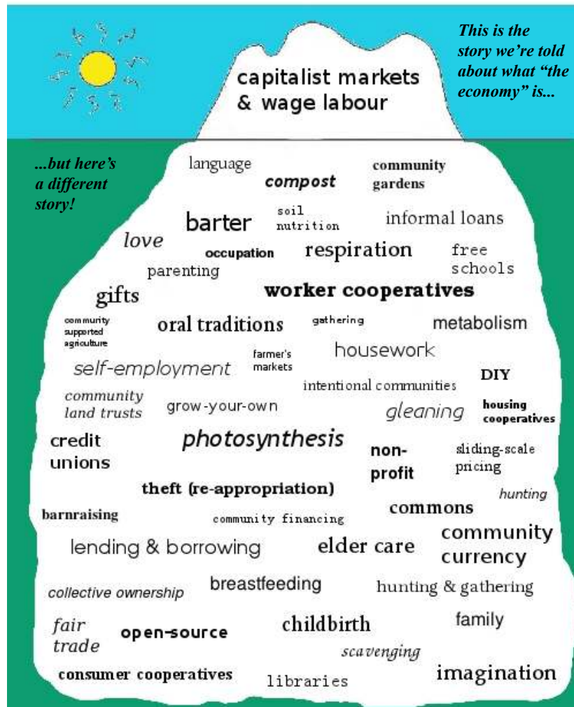
The Iceberg of "Diverse Economies" 9

These are not utopian projects. They are the imperfect shapes of our creative struggles to build different forms of livelihood in this actual world. They call us toward possibilities that we have only begun to explore and to fight for.