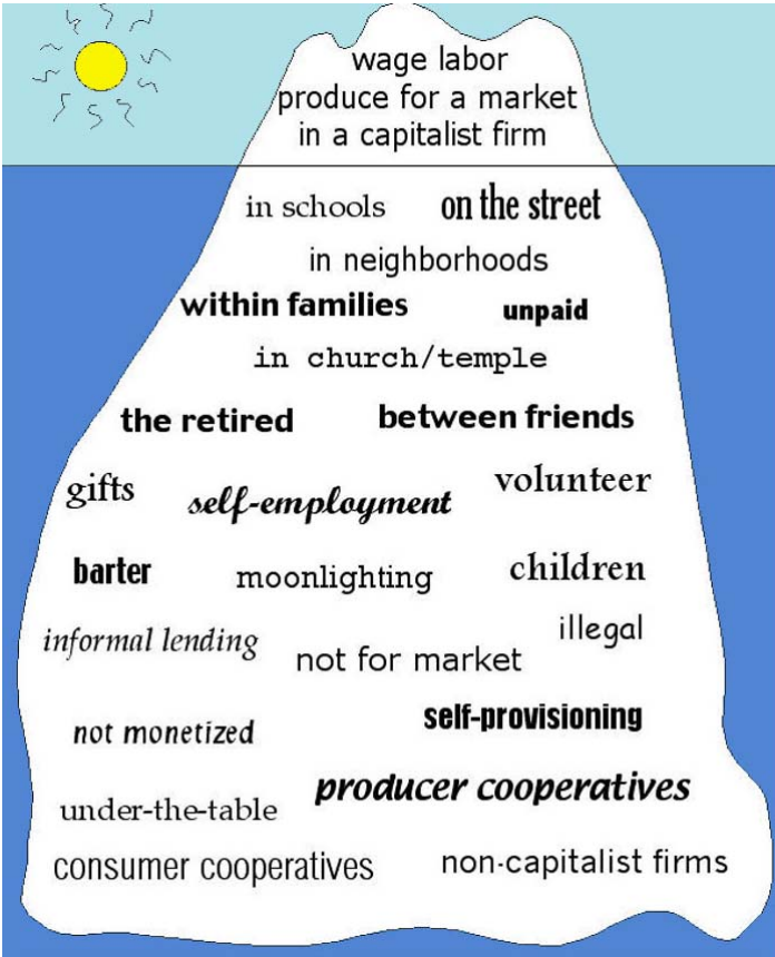
Figure 1: The Economy as an Iceberg

This framework recognises and values the diverse economic practices that sustain our lives. One way of illustrating this diversity is to think of the economy as an iceberg (Figure 1). The top part of the iceberg is usually recognised as the economy. But hidden from view are a host of other economic activities, many which directly contribute to individual and community wellbeing.