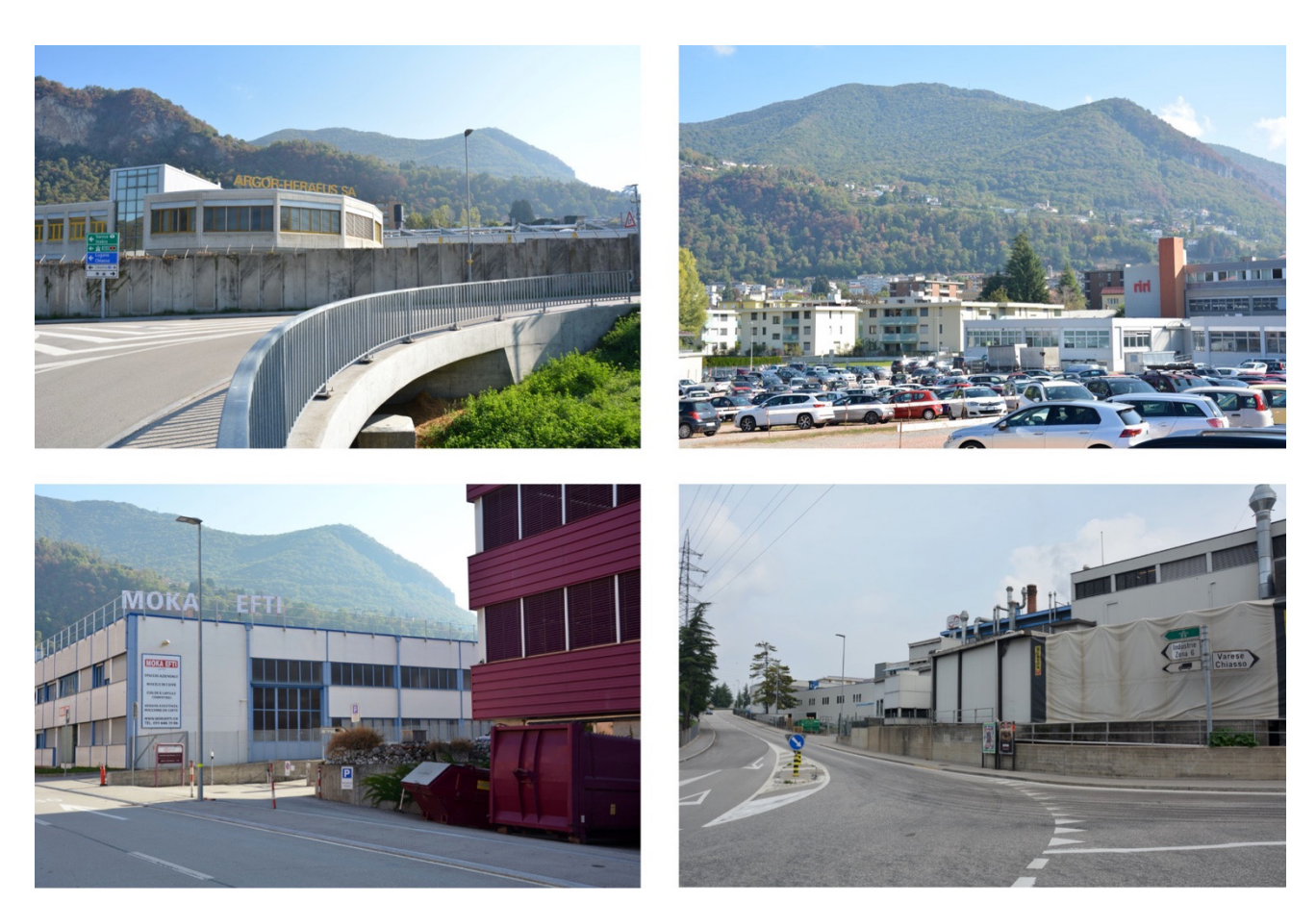
Figure 3. Collage of pictures from Mendrisio's industrial zone.

ration of the Piana di San Martino; then, students conducted field research for their projects and had informal exchanges with a few local actors. We regularly integrated moments of mindful meditation and soft mobility exercises throughout our stay in Mendrisio to connect