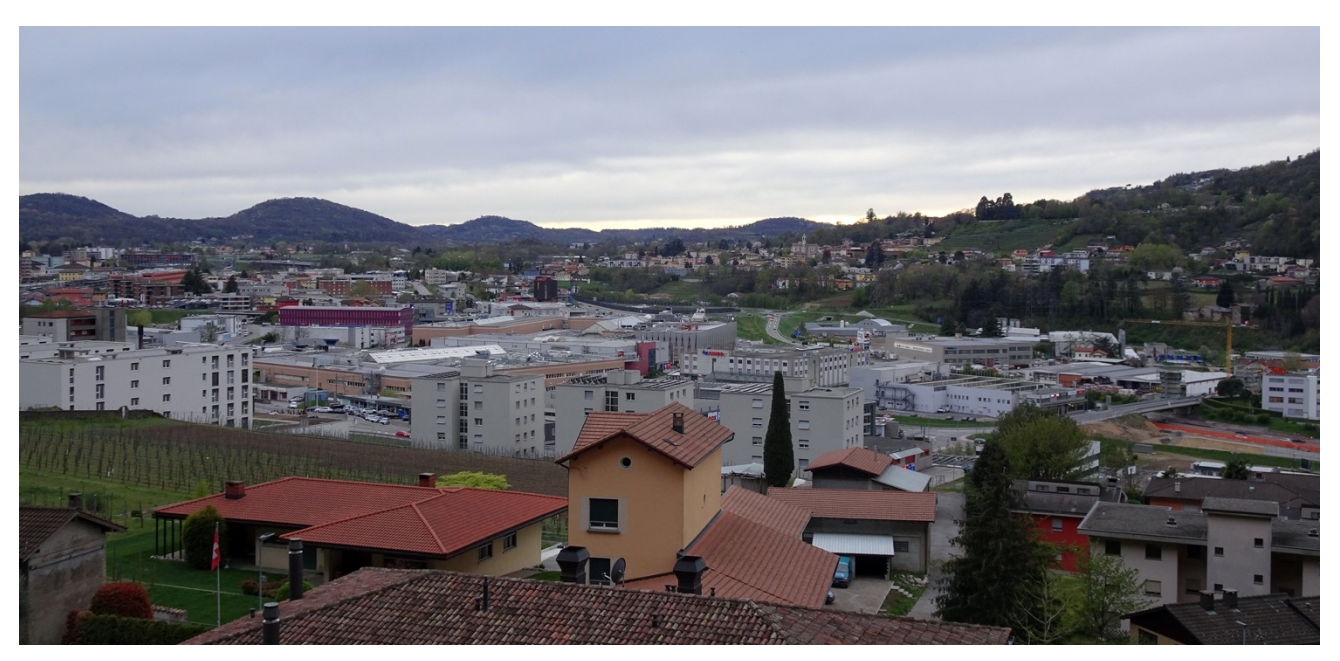
Figure 2. A view of Mendrisio's Piana di San Martino.

an initial phase in which we established a common conceptual framework, the students developed group projects to explore the multisensory dimension of manufacturing in Mendrisio. Fieldwork took place over three days in April 2023. We started with a collective explo-